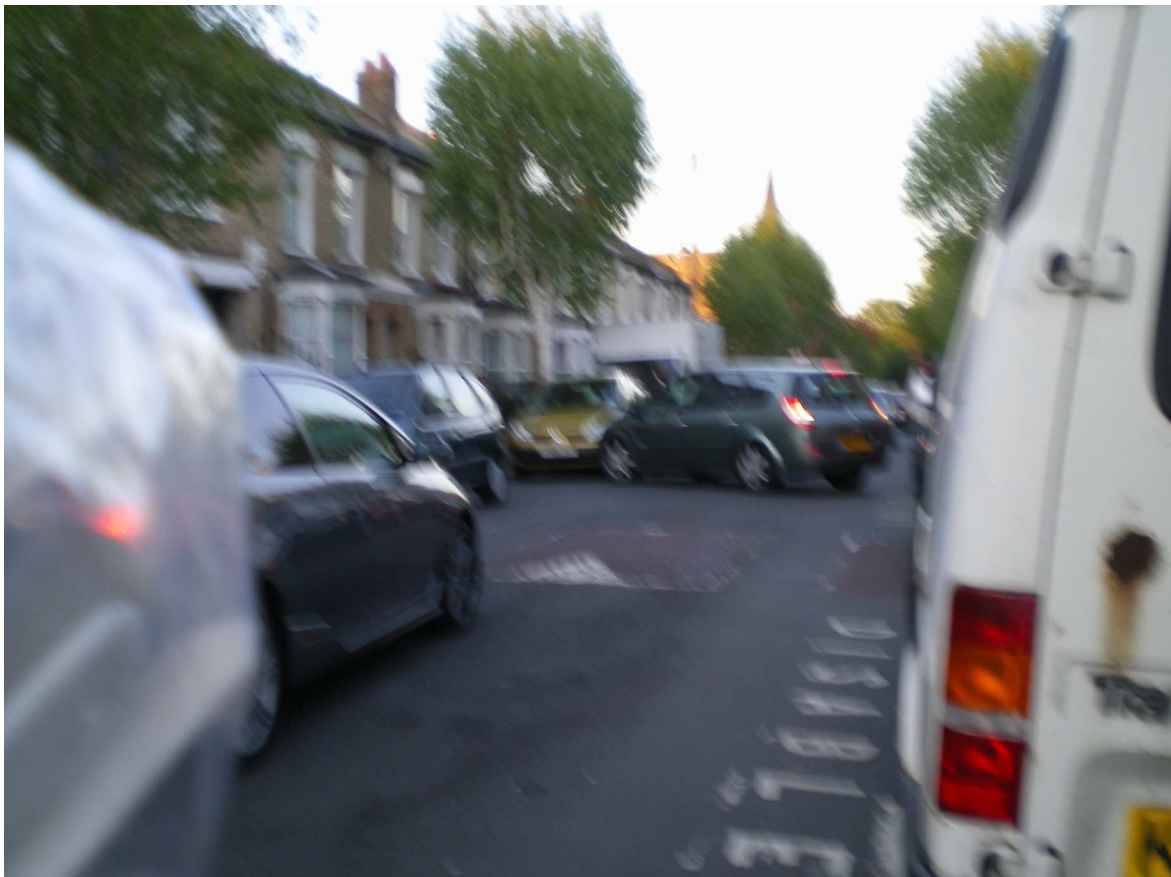
Nutbrook St traffic stopped both ways as cars enter the site