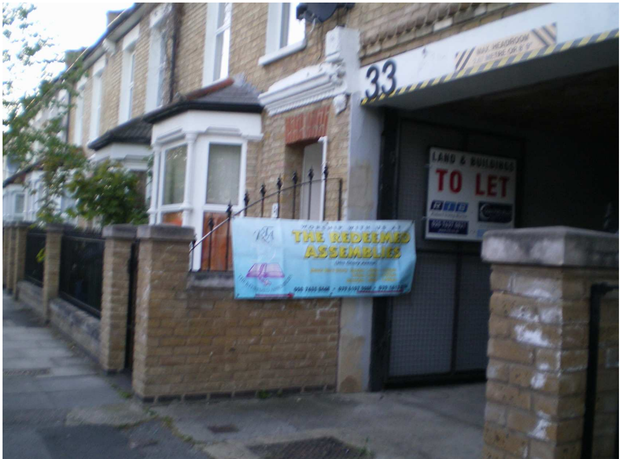
33 Nutbrook Street entrance with The Redeemed Assemblies' banner advertising services