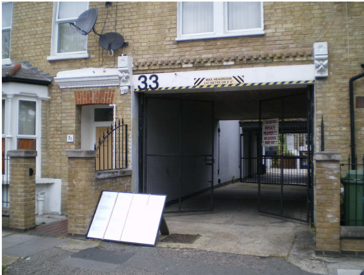
33 Nutbrook St entrance with notice board advertising a range of public services