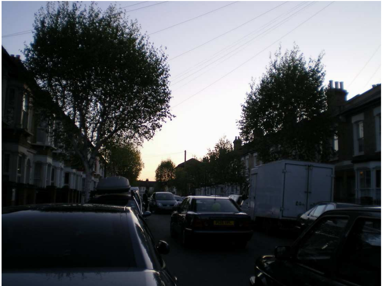
Nutbrook St traffic stopped both ways as cars enter the site