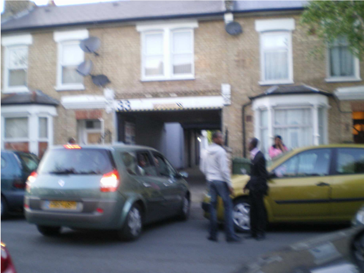
Entrance at 33 Nutbrook Street: people gathering for an event on site

Factory site at 33 Nutbrook Street: photos of The Redeemed Assemblies' activities in Nutbrook Street during April-July 2010, attached to the submission from local resident Eileen Conn on planning application for change of use case number 09-AP-2081