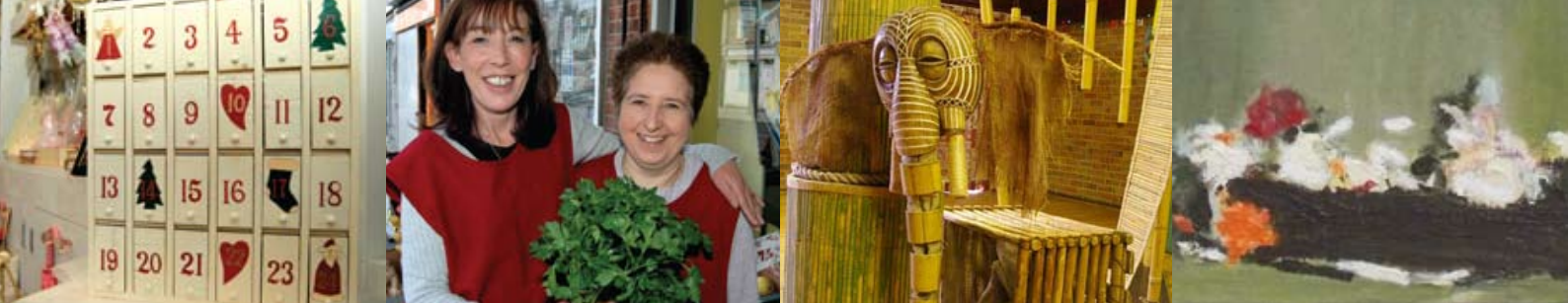
L -R: Advent calendar at A.G Flowers, Nunhead's very own Greengrocers, The Dream Tree Arts Week 2009, Flowers - oil on linen by Jacquie Utleby